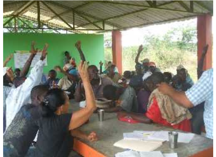
Farm workers at Villa Lobo elect their representatives

The FairTSA programme has a number of process steps, from comprehensive self-organisation in the corresponding cultural context to the agreement of a Community Development Plan and realisation of initially simple and then increasingly complex projects. Such a project, the first phase of which has recently been realised, is described below. It concerns the farm workers at Villa Lobo in the Dominican Republic. Villa Lobo is a finca that primarily produces bananas. Its organic farming process is certified by BCS Dominica according to EU 887/2007 and it also has FairTSA certification. As the first step, the farm workers at the Villa Lobo finca elected a workers’ representative (see photo below).